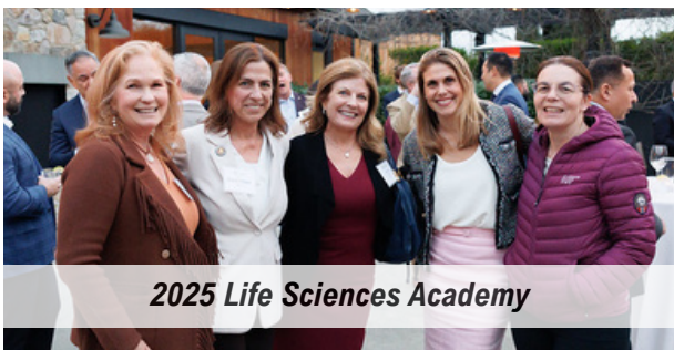
2025 Life Sciences Academy