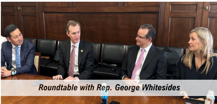
Roundtable with Rep. George Whitesides