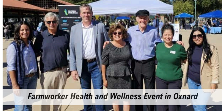
Farmworker Health and Wellness Event in Oxnard