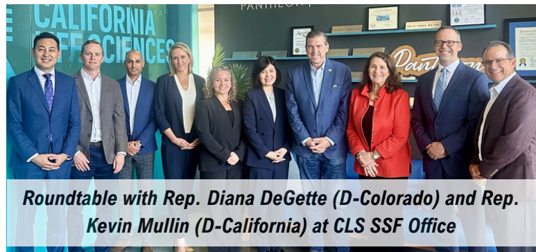
Roundtable with Rep. Diana DeGette (D-Colorado) and Rep. Kevin Mullin (D-California) at CLS SSF Office