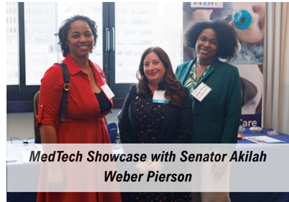
MedTech Showcase with Senator Akilah Weber Pierson

CLS successfully stopped all policy threats during the 2025 CA legislative session and also helped pass some key policies that support our industry.