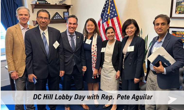
DC Hill Lobby Day with Rep. Pete Aguilar

On Capitol Hill, CLS championed federal policies that safeguard biomedical research, improve access to capital, and foster patient-centered innovation. By convening members in Washington and partnering with national stakeholders, we amplified California's leadership on the national stage.