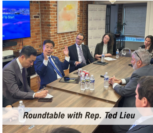
Roundtable with Rep. Ted Lieu