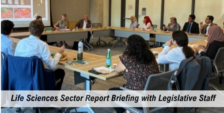
Life Sciences Sector Report Briefing with Legislative Staff

CLS worked closely with state leaders to strengthen policies that protect innovation and expand patient access. From shaping legislation on health equity to building coalitions around industry priorities, our advocacy elevated the voice of California's life sciences community.