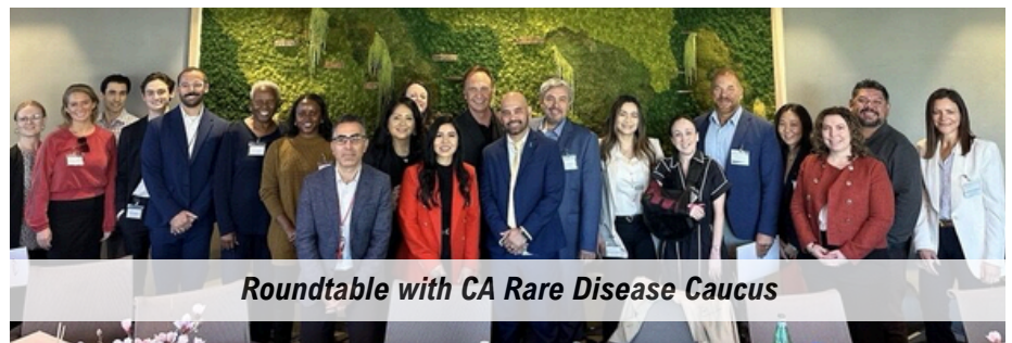
Roundtable with CA Rare Disease Caucus