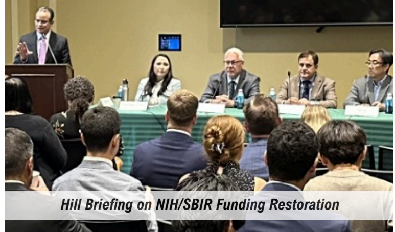
Hill Briefing on NIH/SBIR Funding Restoration