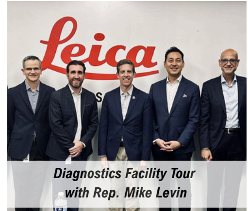
Diagnostics Facility Tour with Rep. Mike Levin