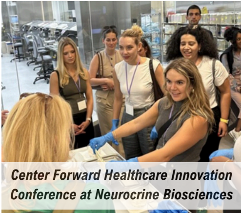
Center Forward Healthcare Innovation Conference at Neurocrine Biosciences